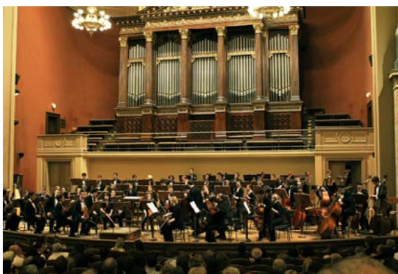
CYO on stage in Prague